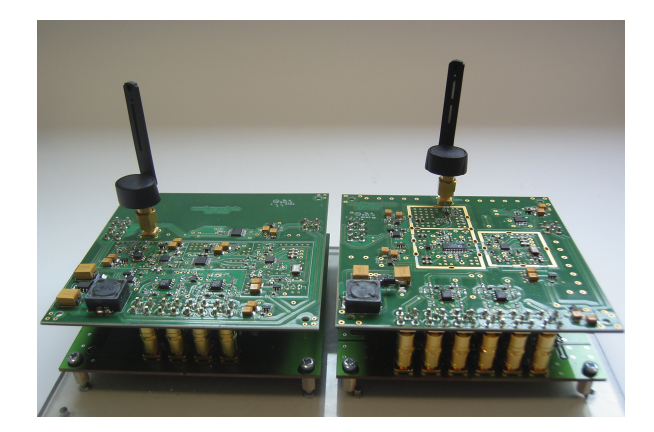
Figure 3 Low cost experimental SDR system from IMWS NUIM

This platform will let us investigate various radio architectures that are amenable to the TETRA-WiMAX system. Our two candidate architectures are a homodyne (direct-to-RF) transmitter and receiver, or a homodyne