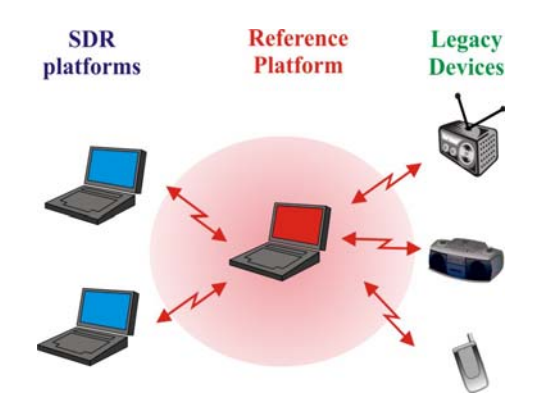
Figure 2 Certification for interoperability

Certification for interoperability is a well studied subject. For any given wireless standard, established procedures and tools already exist. These interoperability tests usually consist of extensive test trials, which include verifying