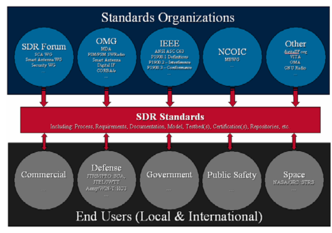
Fig. 1: SDR/CR Standards Stakeholders & Artifacts

Standards use cases would include unique interests from commercial, international, public safety, space, and defense domains. These stakeholders are illustrated in Fig. 1: SDR/CR Standards Stakeholders & Artifacts with their relationship to the partnering organizations occurring through the defined SDR/CR standards. Additionally regulators and waveform and software repository owners would add to or otherwise impact the use cases defined by the domain experts.