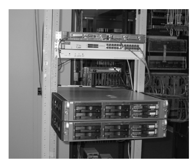
Figure 3: System Hardware at the DeLeon Central Office

After the initial installation of the equipment and tests to ensure that it was functioning properly, Vanu, Inc. employees spent three consecutive weeks at the Mid-Tex site to test and improve the system until it was ready for Mid-Tex to trial. This was the first field trial of the Vanu, Inc. software GSM basestation in a live outdoor environment. All prior testing was in a controlled lab environment.